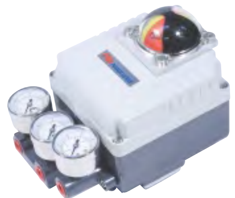
With Dome Indicator

Note: 1) 1/2 split range is available for 3-9 psi input signal or 9-15 psi input signal 2) Please contact for 6-30 psi input signal 3) Operating angle can be adjusted to 0~60° or 0~100°